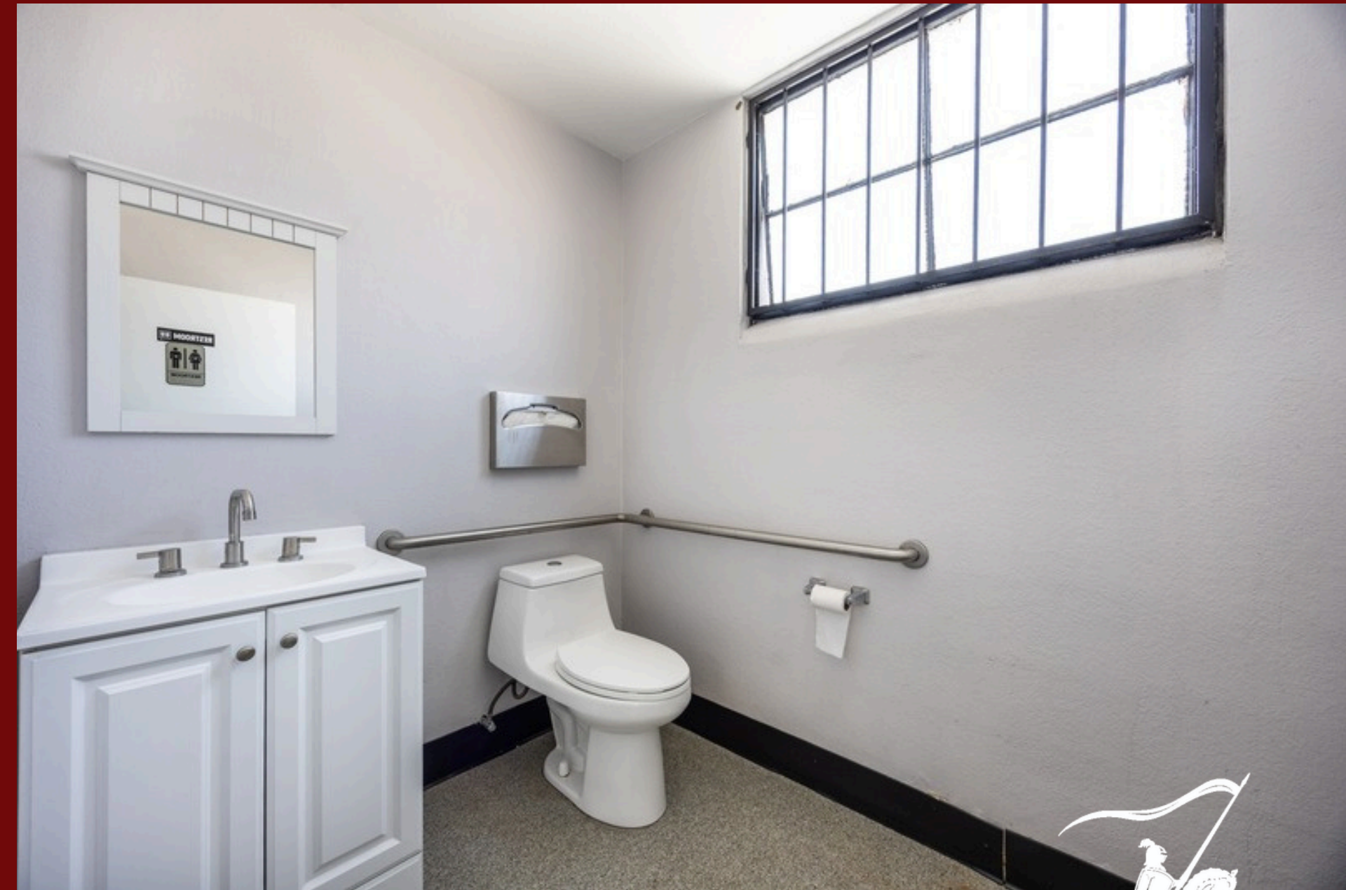
KITCHENETTE & PRIVATE RESTROOM