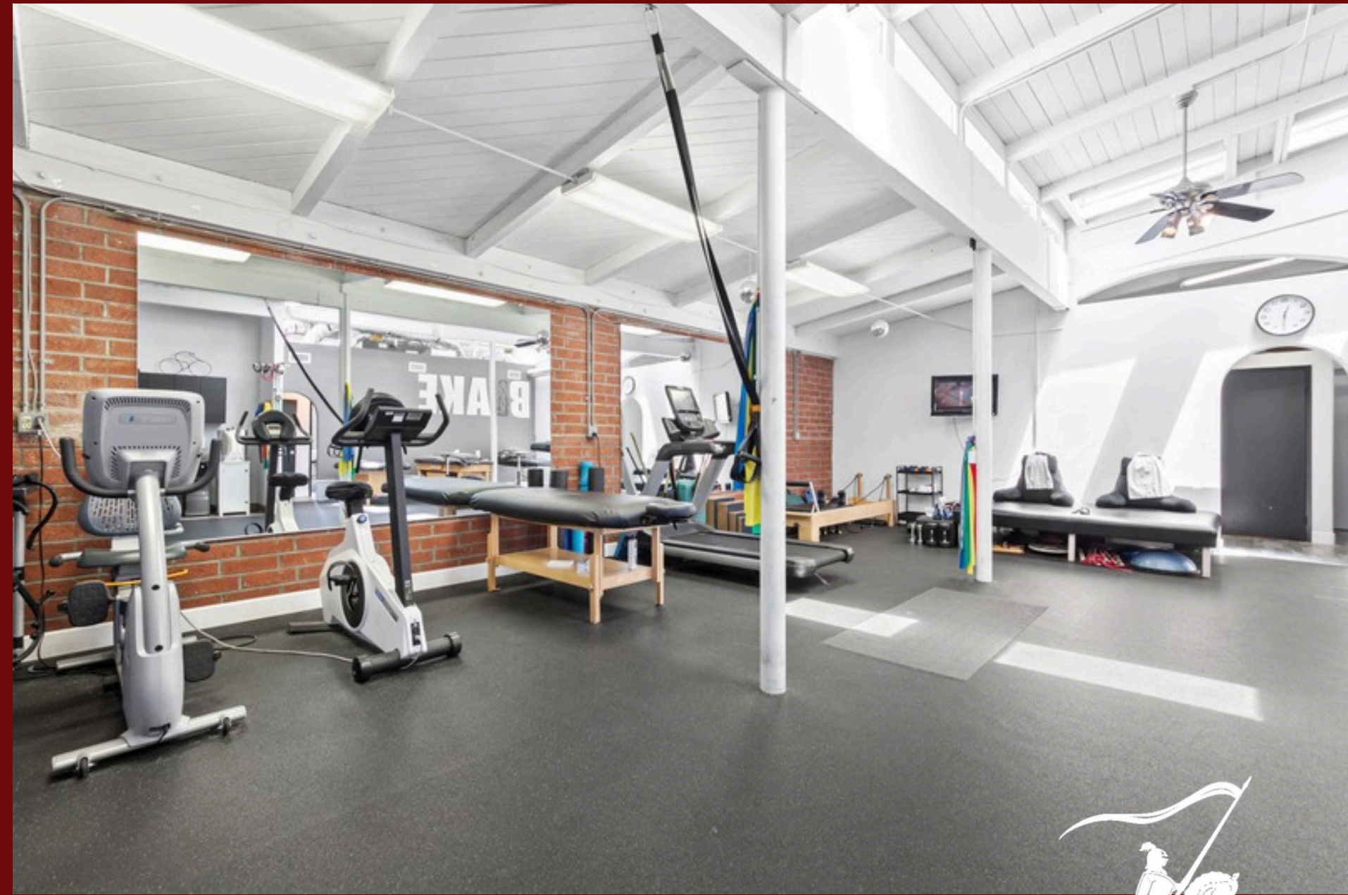
TREATMENT & GYM AREA