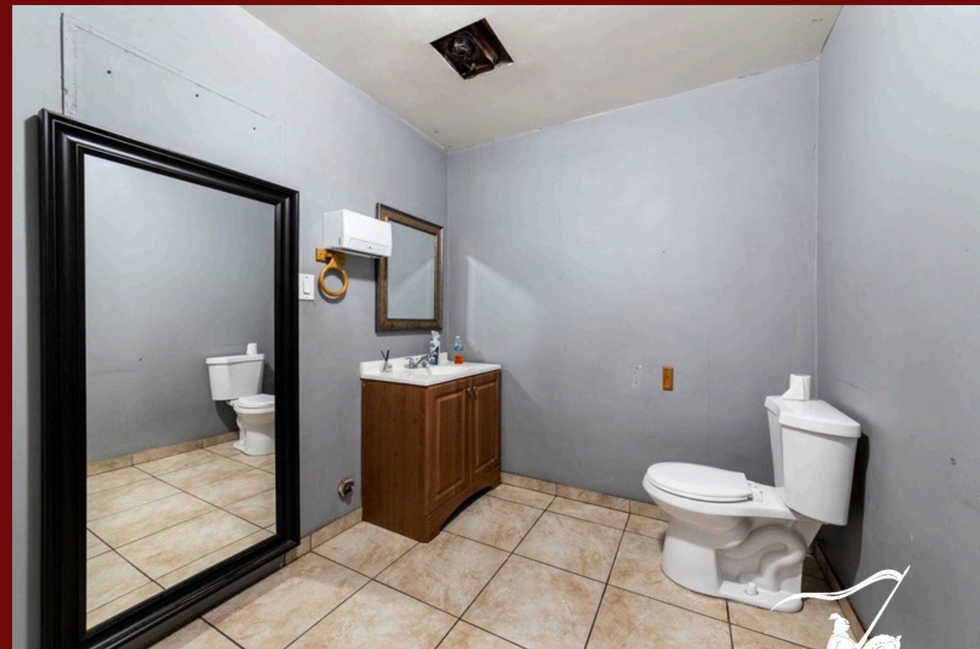
BUILDING AMENITIES CONFERENCE ROOM / PRIVATE RESTROOM